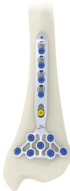
ANTERIOR MALLEOLAR PLATE