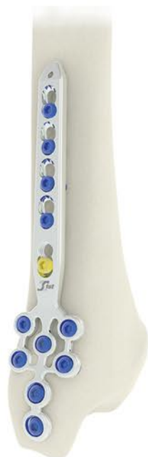
MEDIAL MALLEOLAR PLATE