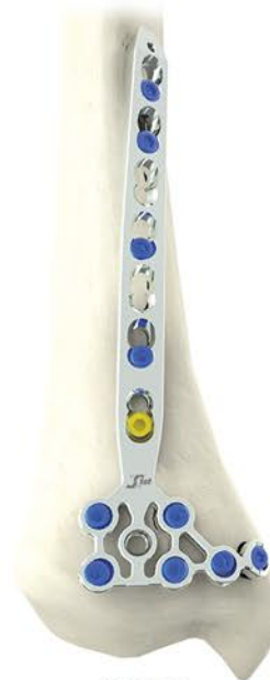
PILON PLATE (cut & shaped)